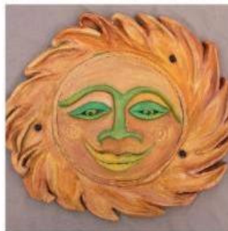
Finding Her Way with Clay SPIEGEL GALLERY