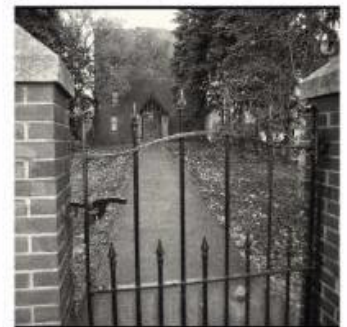
Photographs of Portland THIRD FLOOR GALLERY

Maine Jewish Museum 267 Congress Street, Portland, ME 04101 Monday - Friday 10am-2pm