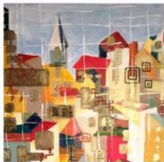
Scaintings by Mirlea Saks FINEBERG COMMUNITY ROOM